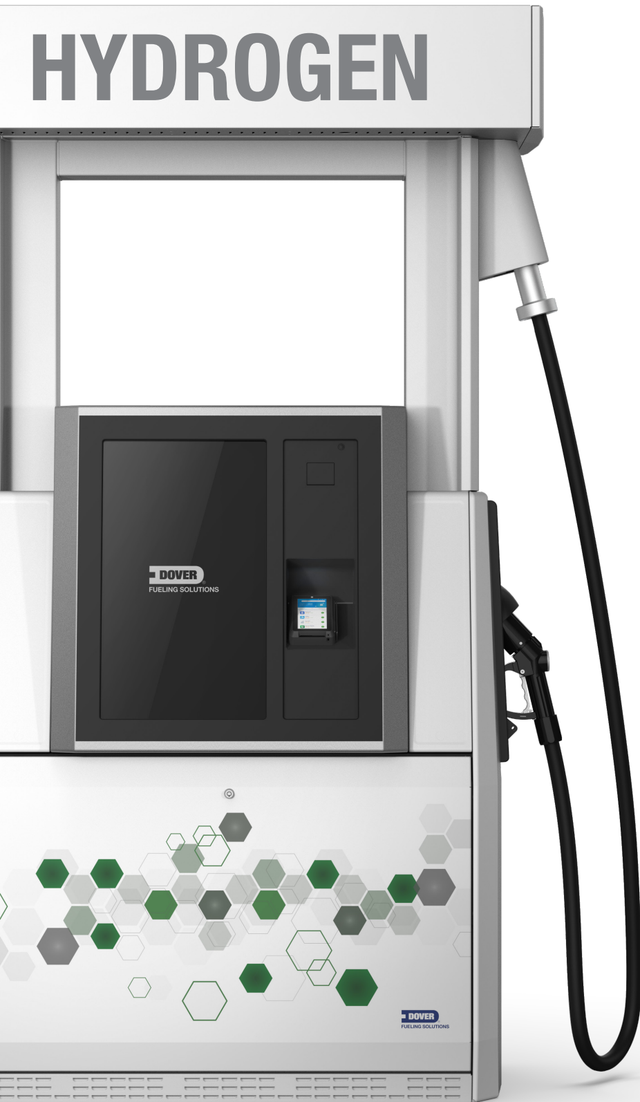
DFS Hydrogen Dispenser