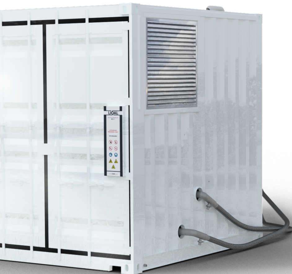
LIQAL Boil-off Gas Treatment Unit (BTU)

We made sure the BTU system was designed to deliver extreme reliability over its long lifetime. It's internal components have been built to last, are field-proven and require fewer maintenance interventions in demanding use and high-throughput applications compared with other liquefaction systems on the market, resulting in a low TCO. Simply put, our BTU system is worth the investment.