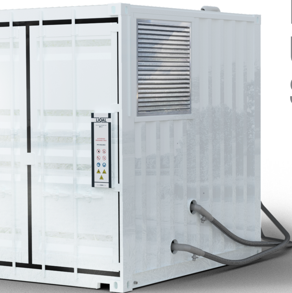
LIQAL Boil-off Gas Treatment Unit (BTU)