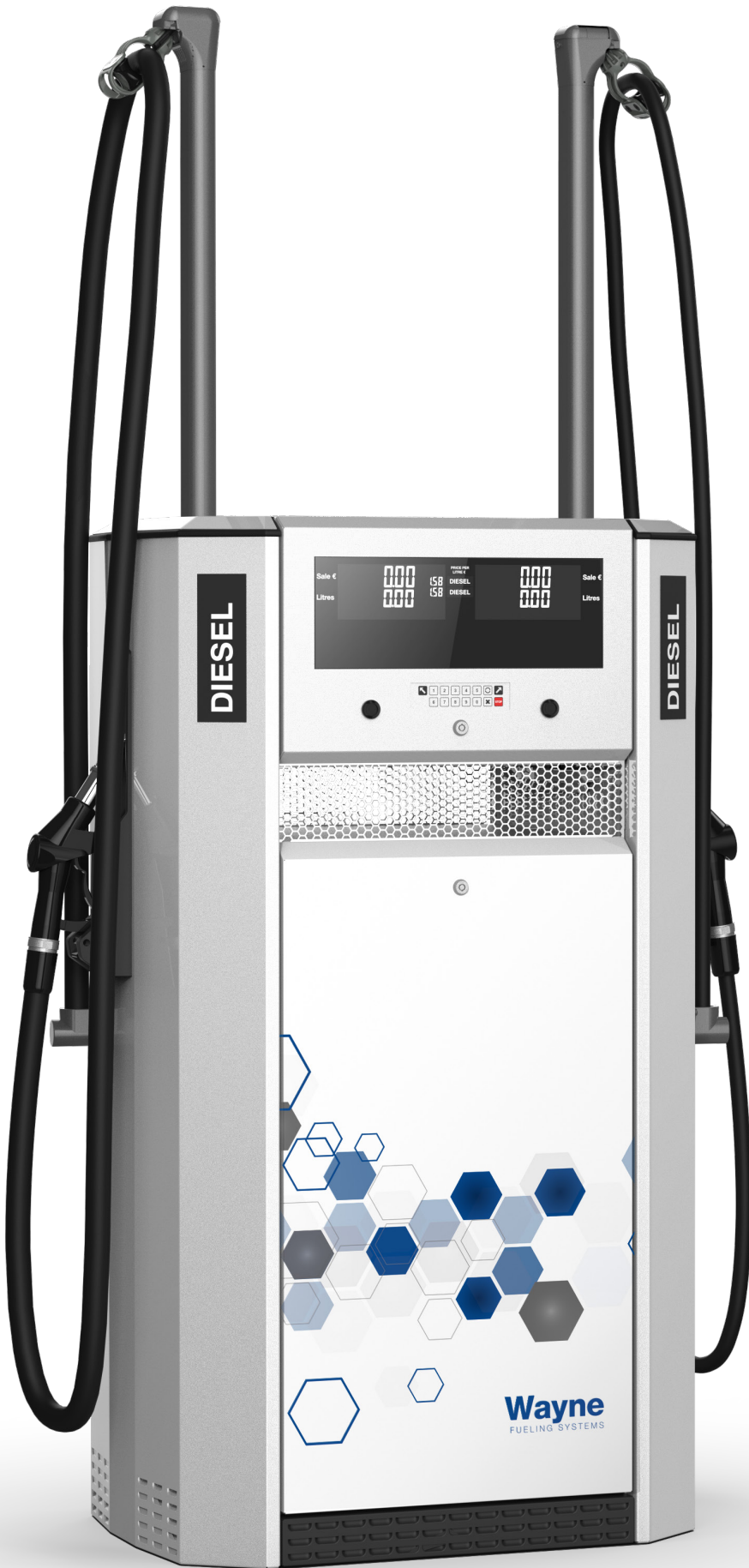
Wayne Century™ 3 fuel dispenser